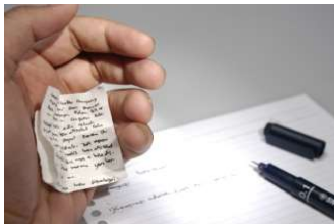
Zdjęcie nr 2