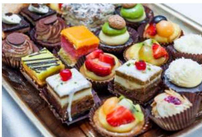
Zdjęcie nr 3