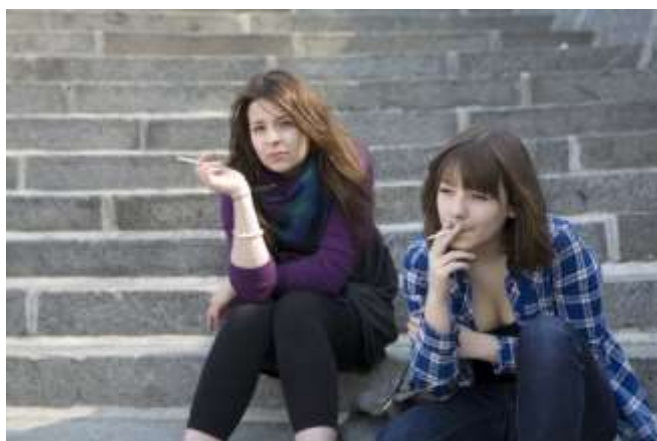
Zdjęcie nr 1