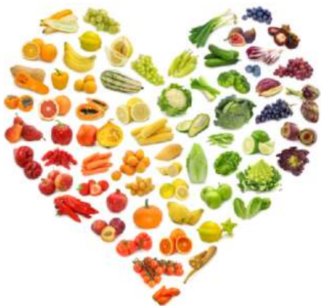
Plakat nr 1