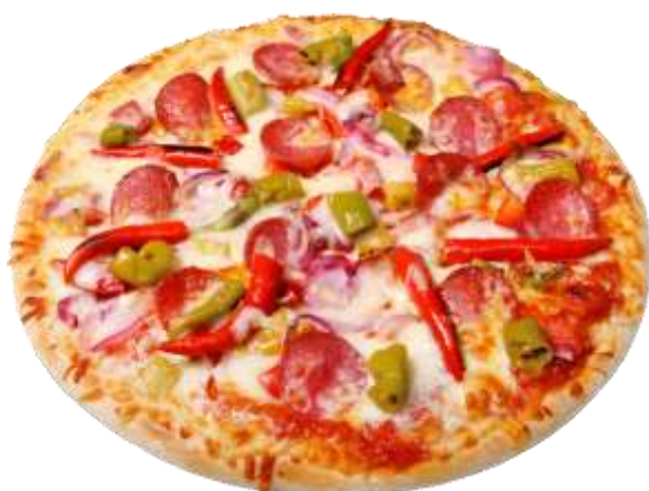
Zdjęcie nr 1